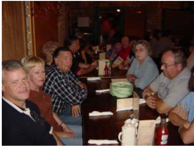
Dinner at the Salt Lick Restaurant

Again we all meet back at the Mountain View Lodge and Mitch led us on for a drive to the Salt Lick restaurant over some very curvy Corvette type roads. The dinner was barbecue served family style and it was excellent. The drive home that night was a little disconcerting with the curvy roads, but we all make it back safely where Ben and Billy treated us to a toast of Merlot wine. We told stories and then ended our trip together with happy remembrances of a good time.