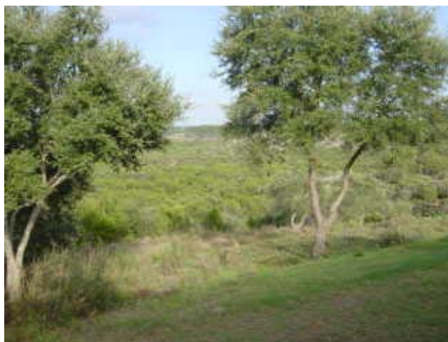
Mountain View Lodge View of Valley

The next morning we met for breakfast at several places in small groups and then shopped in the quaint shops in Wimberley sticking together in groups for an hour or so until couples took various routes to see what interested them the most with an agreement to meet at the Gristmill River Restaurant for lunch in Gruene. Gene and I visited the Wimberley Glass Works where we watched the owner, Tim de Jong, make a beautiful multicolor vase with integral swirling colors of different glass. He wanted to trade me some glass for my 1978 Corvette, but I wouldn't agree. Gene and I then drove the Devil's Backbone which is a highway along the crest of a ridge where you can see the deep valley on both sides of the road.