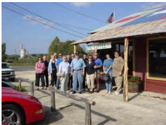
Deutsch Haus Pie & Coffee Shop