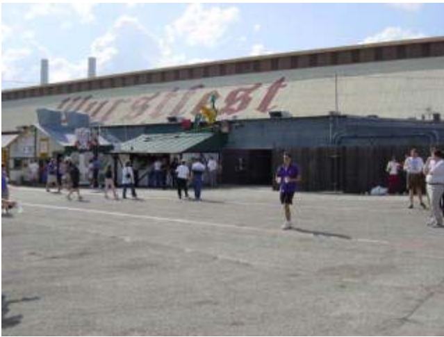
Large "Tent" at Wurstfest in New Braunfels