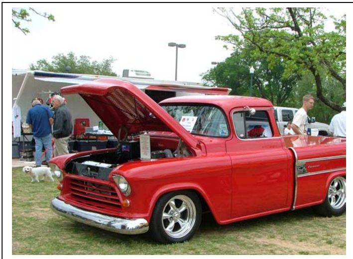
Just a few of the many show entries.